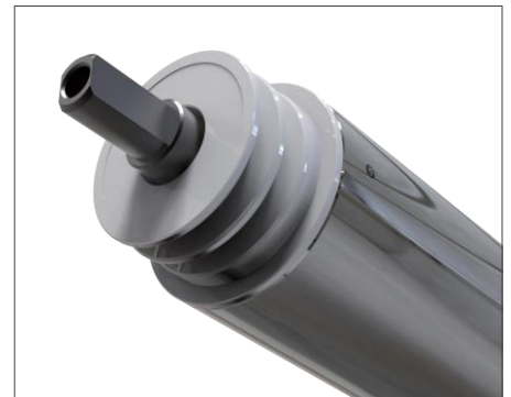
VP - V Pulley