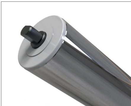
RS - Standard