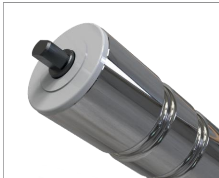
GT - Grooved Tube